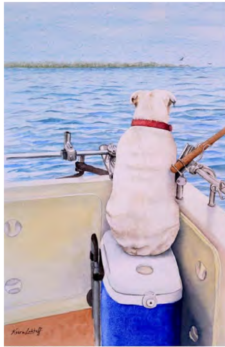
'Sailor Dog' Watercolour by Keera Lokteff